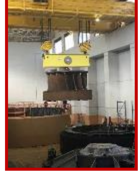
Denison Dam Turbine